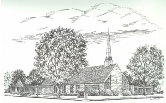
Faith Lutheran Church Joliet, IL